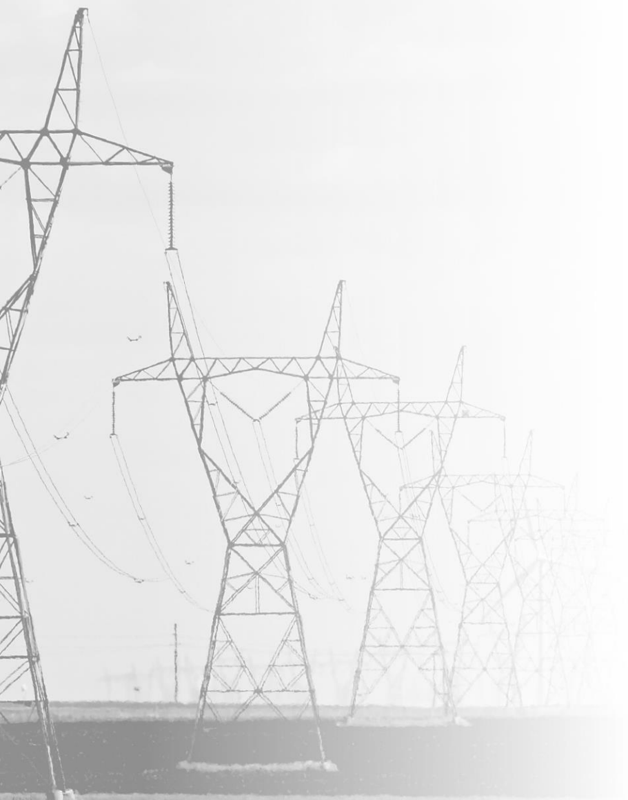
ABB RELION TRAINING (P18005)